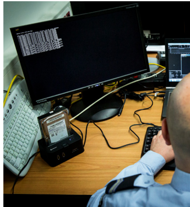
To counter radicalism, terrorism and other threats in general, Dutch society seems to value a well-functioning intelligence and security apparatus more than before

In 2013 the authors of a short essay cautioned against what they called the utopian rhetoric of big data. 4 Without denying that big data holds major potential for the future they claimed that the benefits of large dataset analysis were overstated. To illustrate their point the authors discussed three, in their opinion understated, values: i.e. individual privacy, identity, and checks on power. The description of these values stressed the presence of self-contradictory traits (i.e. paradoxes) in each of the values discussed. 5 This matches the definition of a paradox as a